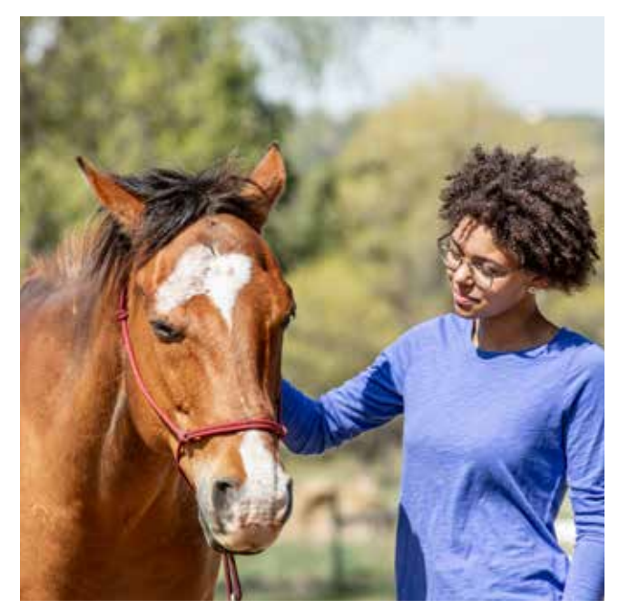
Horses, along with occupational and mental health therapists, facilitate healing for Ranch children.

Predictability and stability, something many of our children haven't experienced, is incorporated into the children's lives by maintaining consistent staff schedules and incorporating routine into each day. Predictability creates an environment that helps build trusting relationships between the children and the staff who work with them each day.