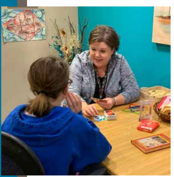
Children at the Ranch participate in weekly individual and group therapy to meet their unique needs.

Our Psychiatric Residential Treatment Facilities, located in Minot, Bismarck, and Fargo, ND, provide the highest level of psychiatric residential care available for children in North Dakota. Our multi-disciplinary teams provide specialized programming and therapy for children with chronic psychiatric and behavioral health issues.