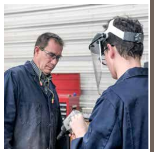
Teachers at Dakota Memorial School believe every child is capable of academic success.

Good nutrition is a critical component in a child's ability to attain psychological and physical health.