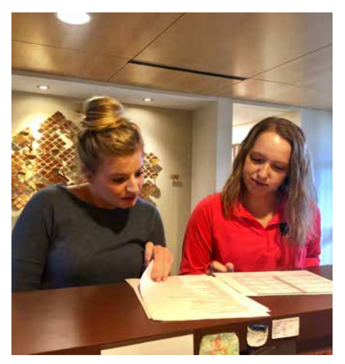
Treatment coordinators and case managers integrate input from clinical staff, school personnel, families, and the children themselves to create individualized treatment plans for each child.