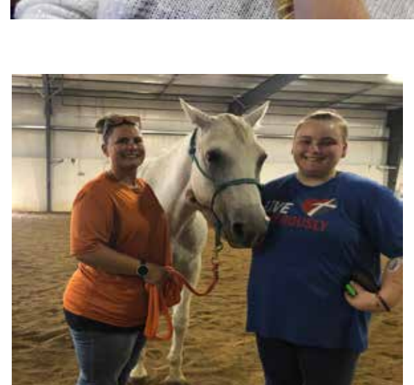
Ranch staff create a safe, family environment for our children to live, learn, and heal.

Family involvement is vital to a child's success in completing treatment and achieving long-term recovery. By providing family therapy, coaching, parenting education, open communication, and support, the Ranch helps families address their own issues—both with the child and in other areas. Our goal is not to help kids be really good at living in treatment, but to help them be successful in their home environment. Open communication and work with families throughout the treatment process leads to lasting recovery.