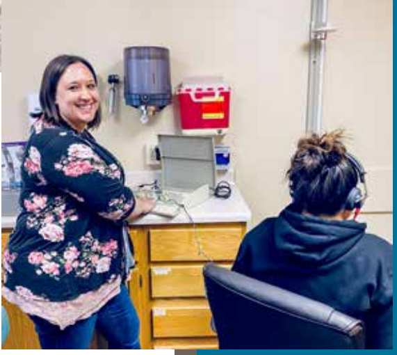
Medical staff are onsite and on call, 24/7.