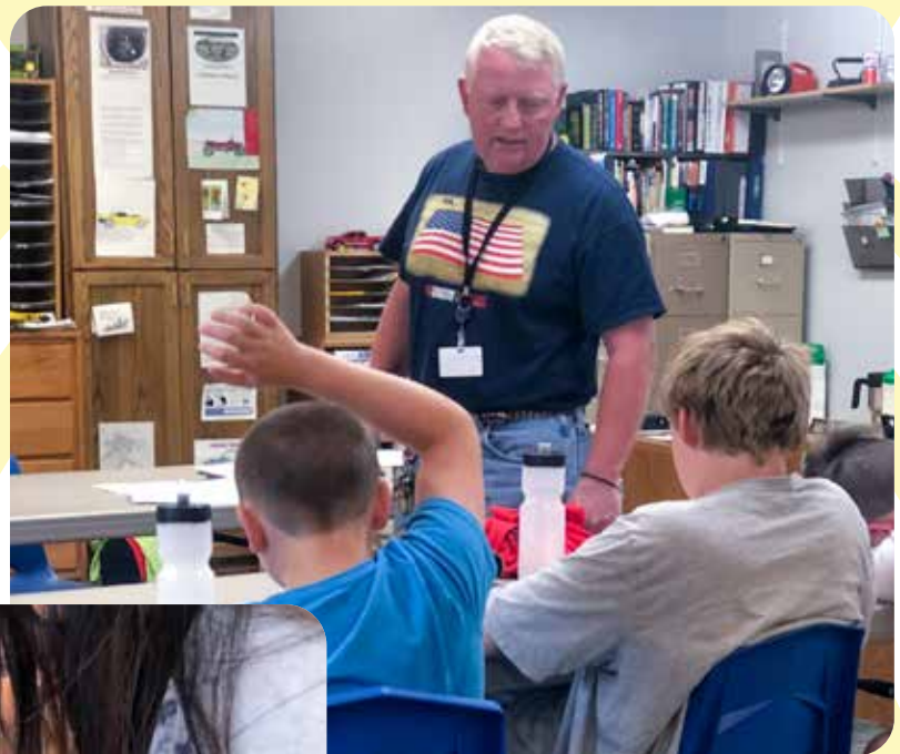
Above: The GEAR Mini-bike Program (Getting Engaged and Responsible) begins with classroom safety training.