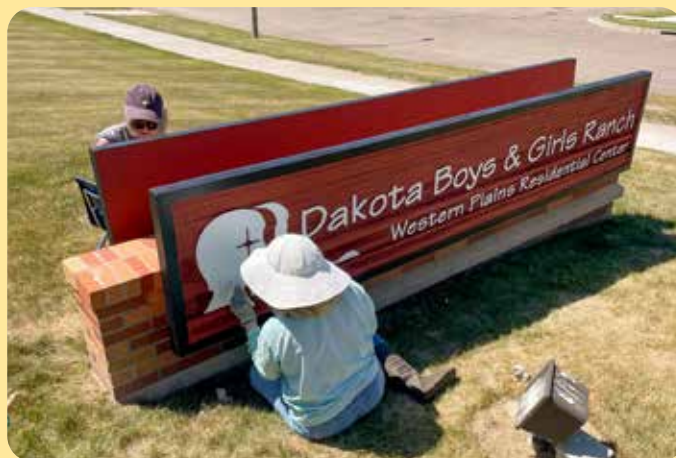
Volunteers from Immanuel Lutheran Church in Cedar Falls, IA, put their passion for the Ranch mission to work.