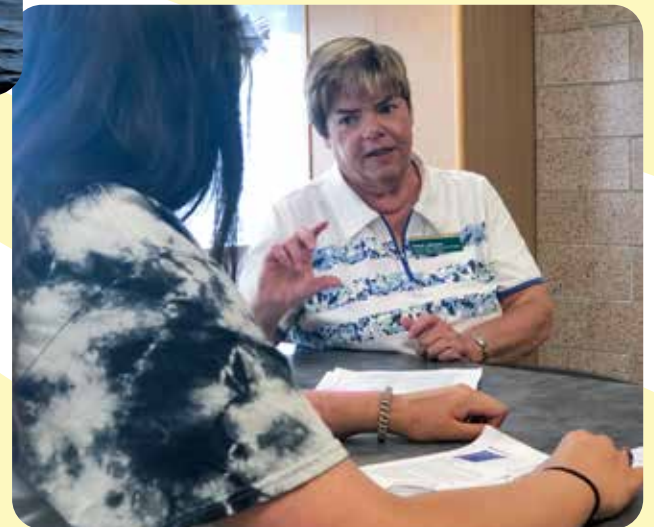
Above: Food and Fun students learned the basics of reading a recipe and measuring ingredients.