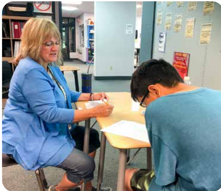
Left: A card game gave one student a chance to practice his math skills in a fun and low-stress environment.