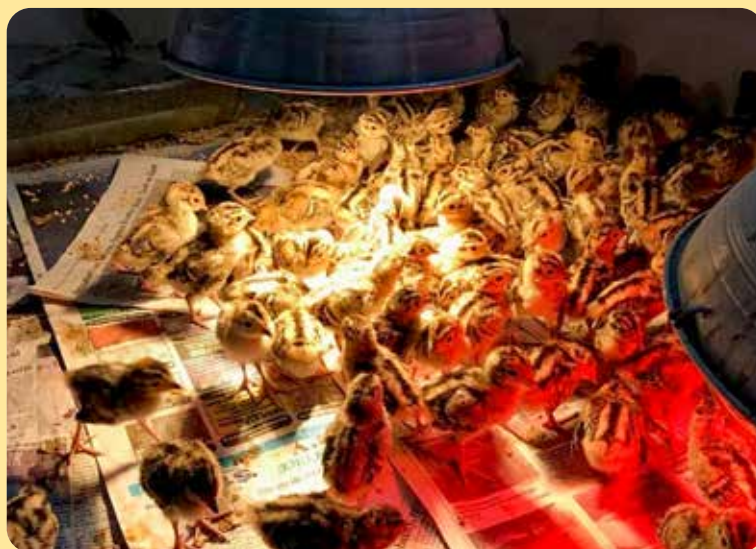
Raising pheasants gives kids at the Ranch the opportunity to care for another living thing and teaches them responsibility.

In mid-summer, when the pheasants are grown and ready to survive in the wild, kids, and staff load them up and do a special release.