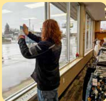
Dakota Memorial School students not only grew the plants and made planters for the sale, but they even helped hang posters around town.

In the Fall, funds raised at the GROW Day Garden Sale will be used by our Leadership Class to distribute grants to departments around campus.