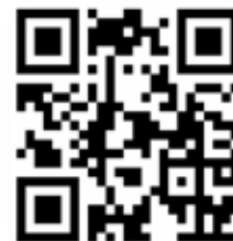
Tree of Life Order Form

If you are a Thrivent Financial member, you may have Thrivent Choice Dollars® available to direct to your favorite enrolled charity. Directing Choice Dollars® to Dakota Boys and Girls Ranch helps us teach Christian values to the amazing children of the Ranch—values that aid in their healing, provide a foundation of hope, and help them be successful in their treatment.