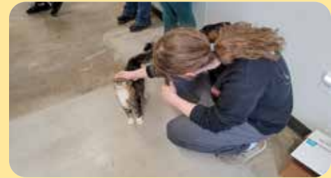
When they delivered the items, members of the Student Council met some of the furry friends they were helping at Souris Valley Animal Shelter.