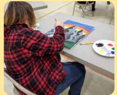
Creating art is a healthy coping skill many kids at the Ranch use to express themselves and practice self-care.