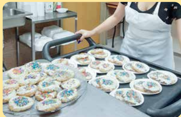
Every staff member at Dakota Boys and Girls Ranch plays an important role in helping kids heal.