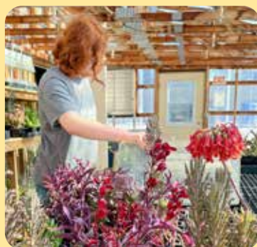
Residents tended to their plants in the greenhouse as they prepared for the GROW Day Sale.