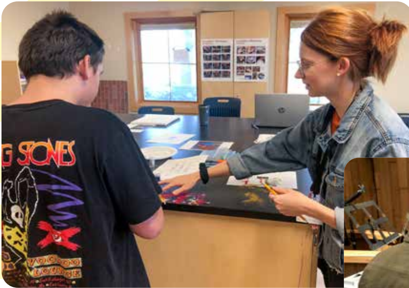
Left: One of our art students decided to decorate his mini treasure box with glitter and glue!