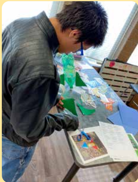
Bismarck kids designed, built, and launched bottle rockets.

During the last week of school, kids at Dakota Memorial School, Bismarck participated in some fun activities including building bottle rockets, karaoke, an on-campus escape room, airplane making contests, trivia, and a campus-wide clean up!