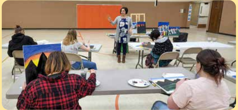
Art helps kids at the Ranch tap into the creative parts of their brains, which helps them work through their trauma.