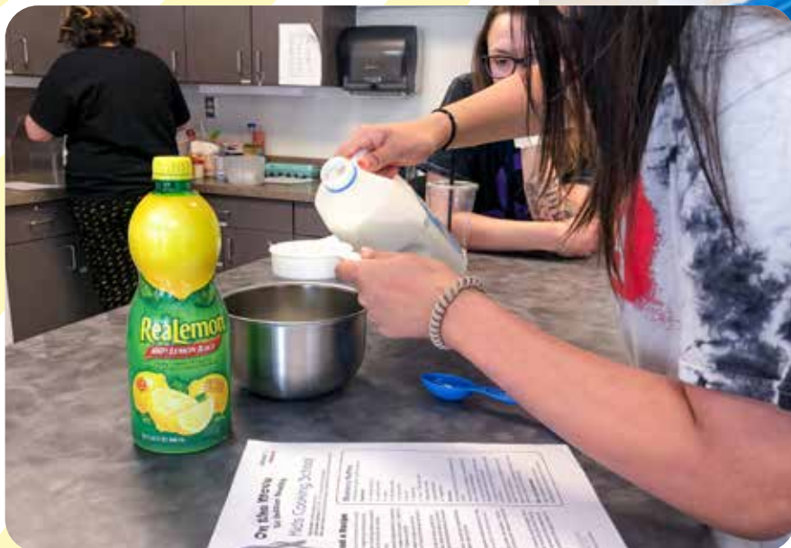
Left: The day’s Food and Fun project, baking blueberry muffins, was fun and delicious. And, the kids learned a lesson in weights, measures, and how to read a recipe.