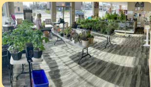
Strong winds moved the garden sale inside the thrift store, but that didn't dampen the spirits of the shoppers.