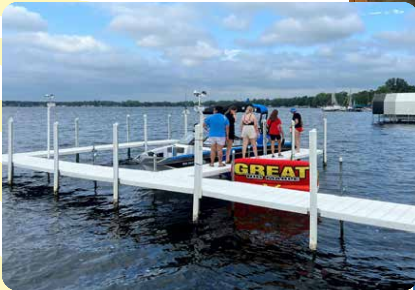
Left: Wake the World (WTW) boat owners gave Ranch kids a day on the water to waterski, wakeboard, and tube behind the boat—providing a “normal” summer experience where they could practice their social skills and in some cases, face their fears.