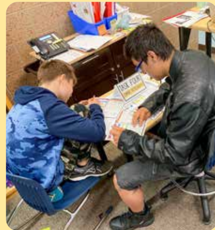
Ranch kids completed a series of tasks to beat the “escape room.”