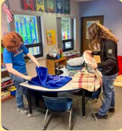
Student Council members sorted the donated blankets and towels to ensure they were in usable condition.

To celebrate Earth Day, Student Council members at Dakota Memorial School, Minot hosted a used towel and blanket drive. Students donated the collected items to a local animal shelter.