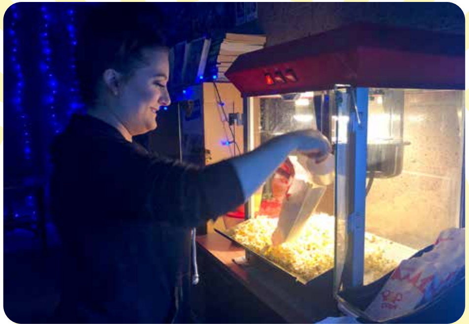
The kids learned about movies and actors of the 1930s in the math room turned theater—complete with movie popcorn!