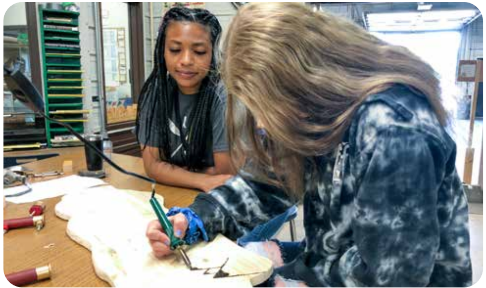
Above: Students use a jigsaw and woodburning tools to make their own charcuterie boards.

While the classes are different, the structure of summer programming is the same on all three Ranch campuses. Classes start at 9 a.m. and go until noon, Monday through Thursday. Residents are split into small groups that rotate