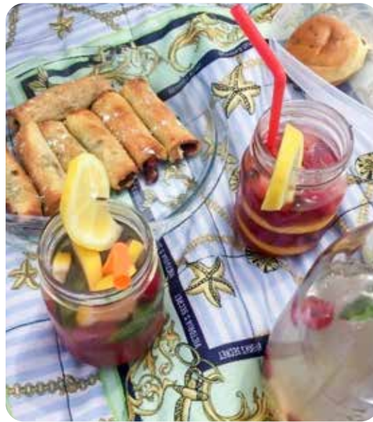
A young resident at the Fargo Youth Home prepared a picnic using the cooking skills she learned at the Ranch.

Independent living programs at the Ranch help residents ease the transition, making them more likely to succeed on their own and less likely to experience homelessness and unemployment.