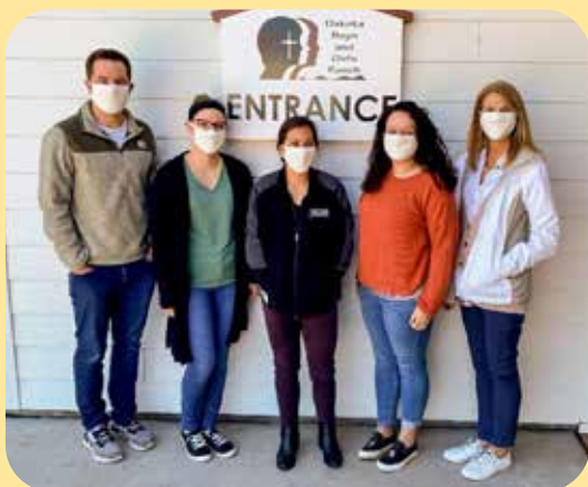
Above: A group of Fargo staff modeled masks donated by Aviator, a small company in Los Angeles, CA, that makes jeans, hoodies, and t-shirts. Right: Ranch residents each decorated their own Aviator mask.