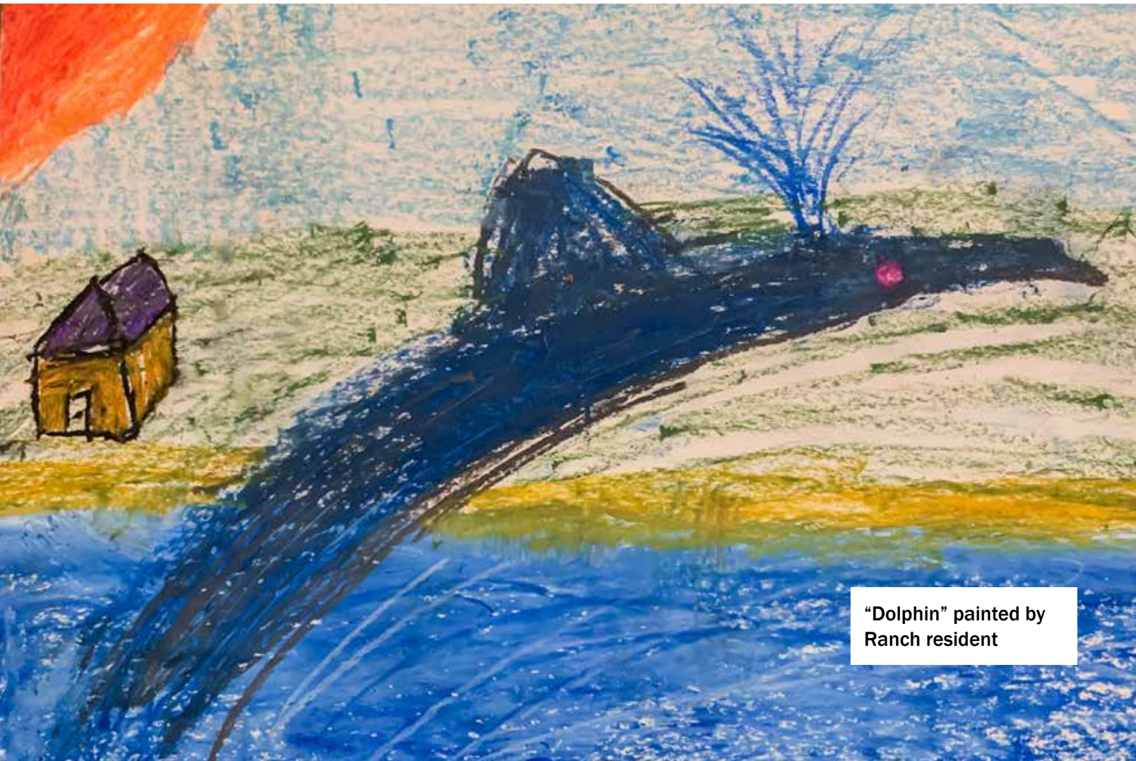
“Dolphin” painted by Ranch resident

The mission of Dakota Boys and Girls Ranch is to help at-risk children and their families succeed in the name of Christ.