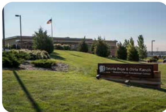
The Ranch expanded to Bismarck in response to a need for additional residential treatment services in the state.

The North American Lutheran Church became the latest Lutheran denomination to support the Ranch ministry in 2019.