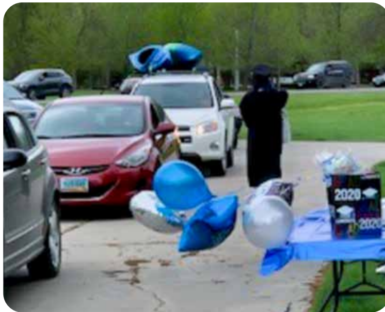
Teachers lined up in their cars around the block, waiting to share their socially distanced congratulations with each graduate.

"I'm not sure how we'll maintain the level of communication we had with the parents/guardians of our Day Students."