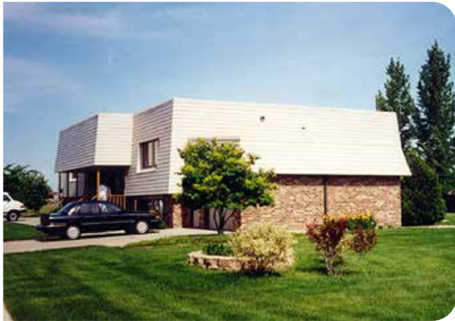
Children develop life skills through Independent Living Services provided at the Fargo Youth Home.

Years of discussion and planning led to the opening of the Fargo Youth Home in 1988. The Youth Home began as a group home for boys, and in 1993 became the first Ranch facility to accept girls.