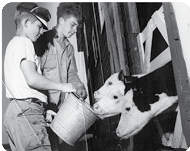
In the early days, Ranch boys learned good work habits by helping with the chores.

The 1970s were a time of big changes at the Ranch. 160 acres of adjacent land were purchased and the treatment program was expanded to include vocational