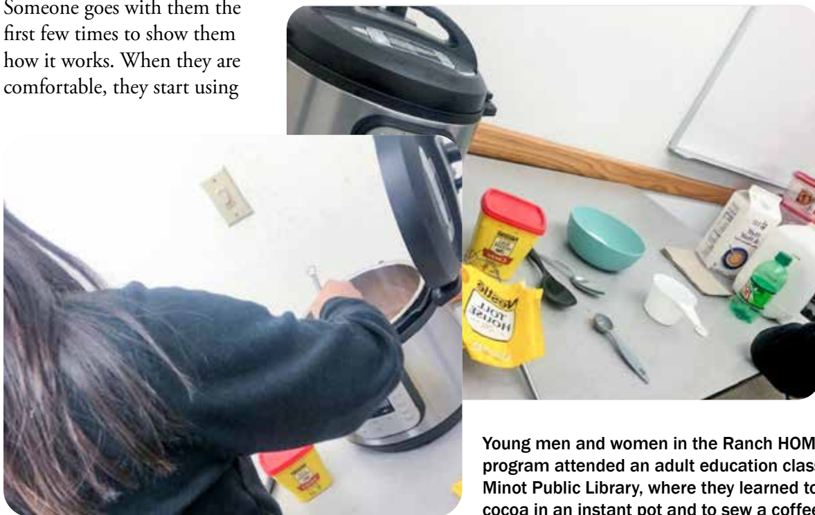
Young men and women in the Ranch HOME at Northgate program attended an adult education class held at the Minot Public Library, where they learned to make hot cocoa in an instant pot and to sew a coffee koozie.

*Name changed to protect confidentiality