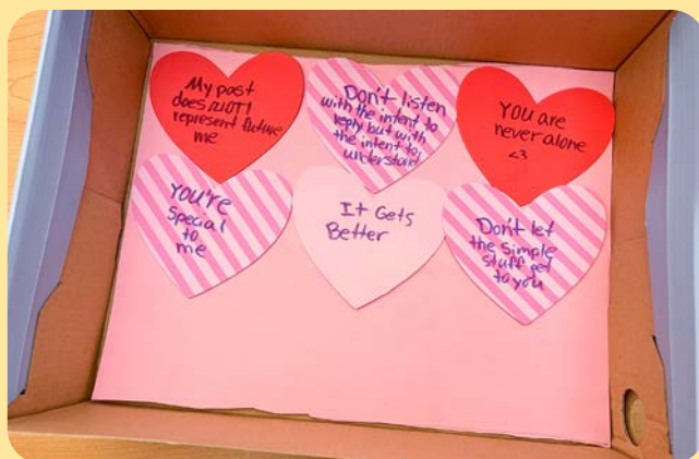
One child included affirmations at the bottom of their box as a reminder of how loved they are.

Kids on our Fargo campus decorated Valentine's Day boxes, which were then filled with notes of encouragement and sweet treats by Ranch staff. For some Ranch kids, this was the first Valentine's box they'd ever had.