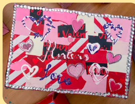
Our kids tapped into their creativity as they decorated their special Valentine's Day boxes.