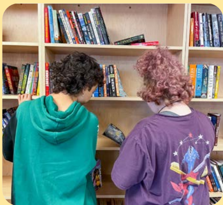
Kids at the Ranch love to read and are excited to have a wider variety of books to choose from!

In the last issue of Ranch Voice, we shared the importance of reading at Dakota Memorial School, and asked for your help in filling the shelves of our school libraries. We're very grateful for our Ranch friends who purchased over 250 books for our Dakota Memorial School libraries and classrooms!