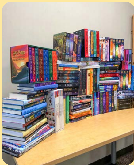
Ranch friends from across the country donated books that will be loved and read by our kids.