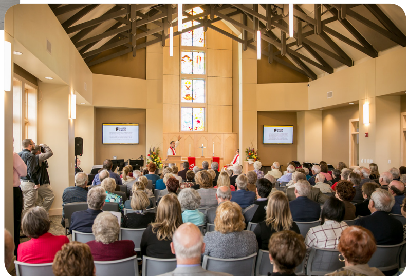
A celebration service in the Gudrun R. Marx Chapel, during which we dedicated the Chapel to the Glory of God, capped off the day's events.