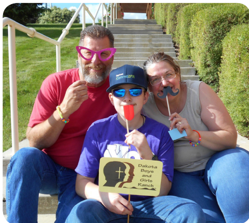
Cain (shown here with his parents at Summerfest) is just one of the many kids who experience love and healing at the Ranch.

*Name changed to protect confidentiality