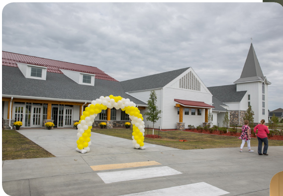
The completed Fargo expansion project houses the Gudrun R. Marx Chapel, Thrivent Mutual Funds Nutrition Center, and a gymnasium.