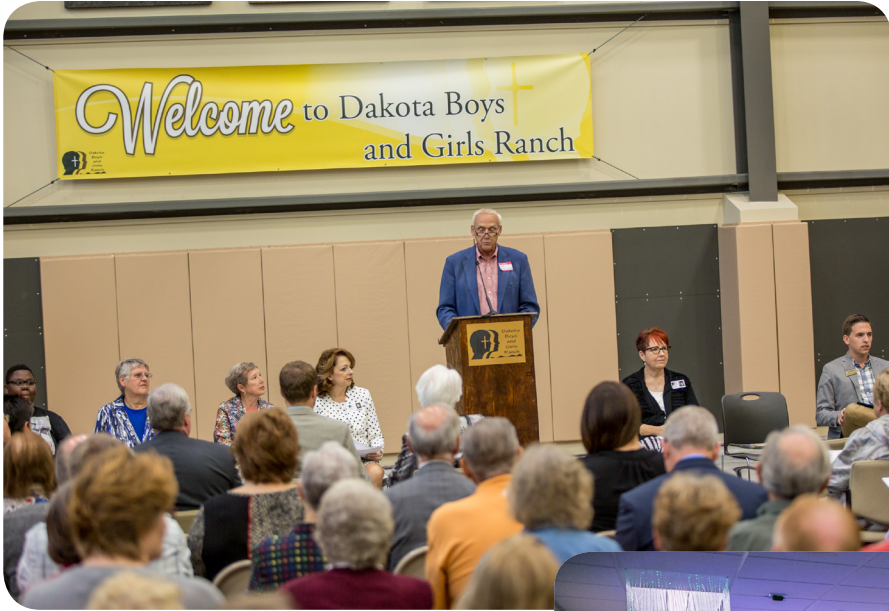
Hundreds of people gathered for the ribbon cutting ceremony that kicked off Heading Home.