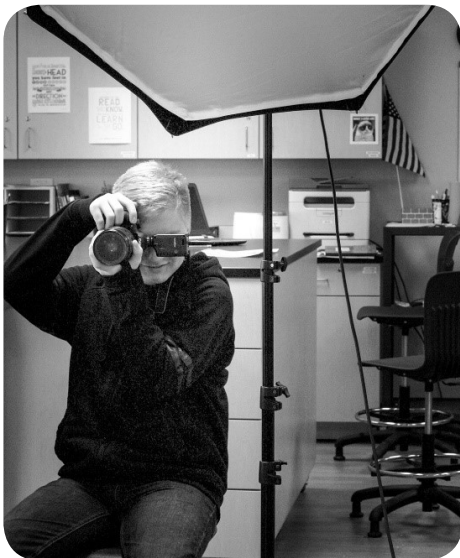
Dakota Memorial School student discovers a love and talent for photography.