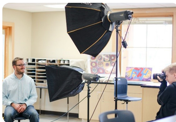
Discovering new passions and skills builds self confidence in our residents.